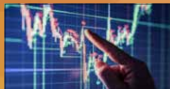
Daria image source